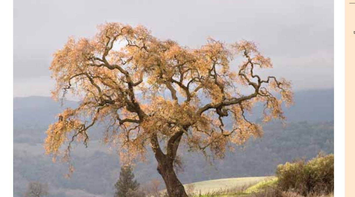
16 ■ The Almanac ■ January 31, 2007

And all the while the tree stands still as it always has, in silent communion with the hills and constant partnership with the sky, solemn marriage with the earth from which all progeny emerge, soundless cacophony, boisterous silence simply there with only the dew to mark the passage of night to day.